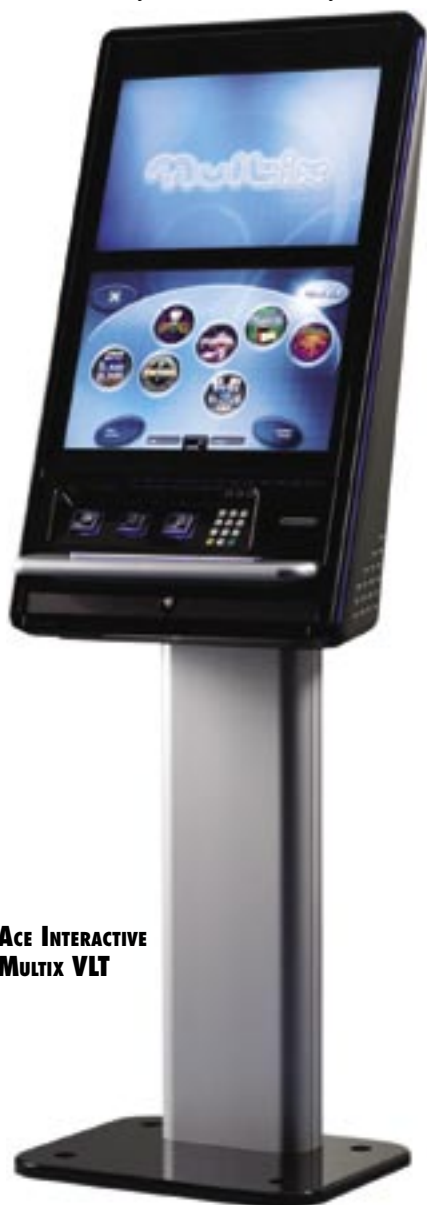
ACE INTERACTIVE MULTIX VLT

"Almost all games planned for 2009 will be supplied by ACE, either